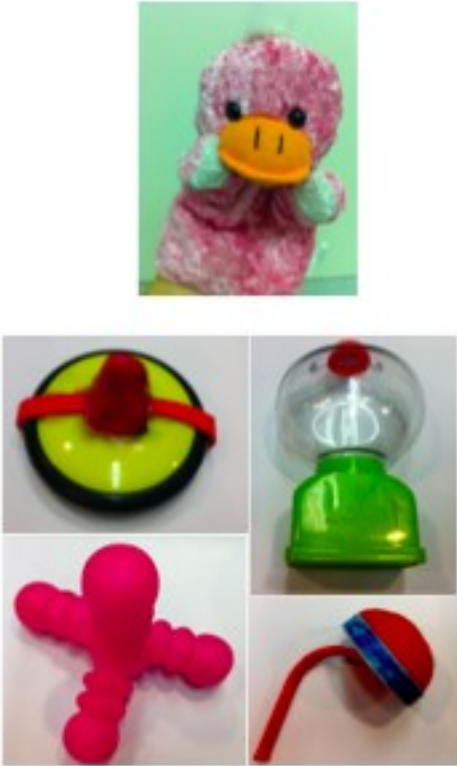
Figure 1. Materials used in Experiment 1.