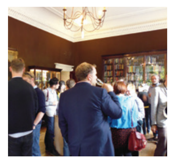
Exhibition opening at Trelissick House.

'For me this conference highlighted the interest in, and need for, debate, discussion and celebration of practices which blur the boundaries between established craft activities and newer digitally-empowered "making". Projects and completed works were presented that point towards a future where digital capabilities are combined with the poetics and material sensitivity of craft in exciting and challenging ways.'