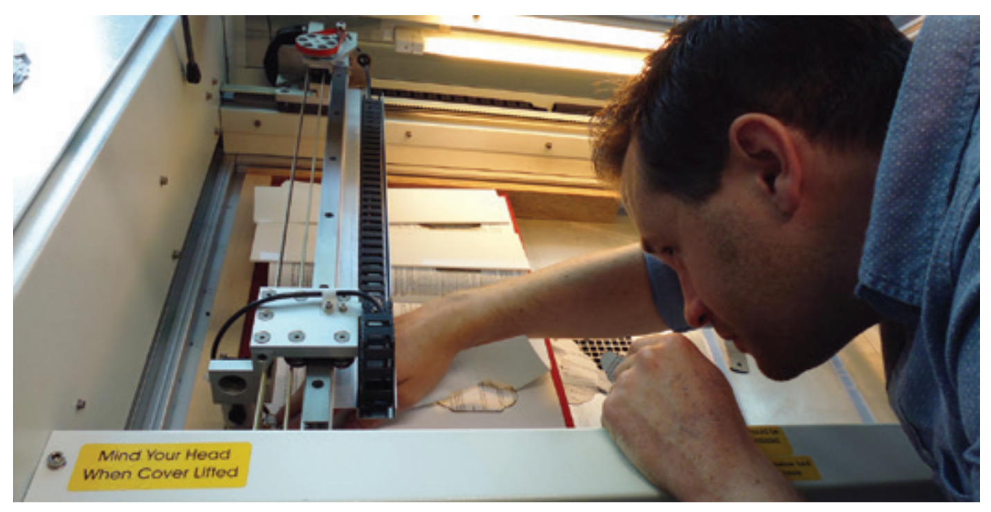
Laser cutter in the MakerNow facility in Falmouth University, Peryn campus.

The final discussion at the conference was overwhelming for some, however like all tools, equipment and development, we need to select an area in which we are interested.