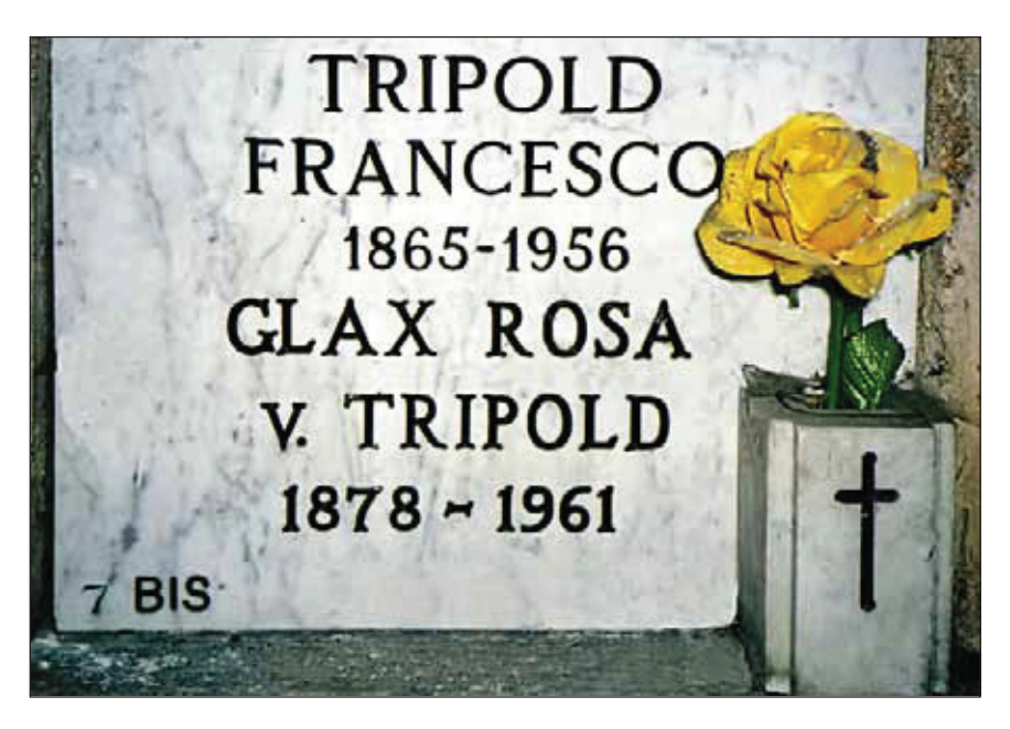
Figure 4 - The Tripolds' Urn Tomb. Cimitero Monumentale di Torino.

Slika 4. Groblje Cimitero Monumentale di Torino. Grobnica za urne dr. Tripolda i njegove supruge.