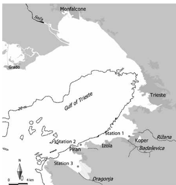
Fig. 1. A map of the Gulf of Trieste with stations included in the biomonitoring programme with geographical coordinates: Station 1: 13^{\circ} 43,36' N , 45^{\circ} 33,00' E ; Station 2: 13^{\circ} 35,40' N , 45^{\circ} 31,93' E ; Station 3: 13^{\circ} 35,00' N , 45^{\circ} 29,40' E

from local agriculture. The impact of this inflow is significant after a rainy period; otherwise the stream flow is quite small. Station 2 is 11.4 km away from Station 1, and 9.2 km away from Station 3. The content of Cd in the sediment was in the range from 0.155 mg/kg to 0.112 mg/kg, and in the sea water was from 2.3 \mu\text{g/L} to <0.1 \mu\text{g/L} . Moreover, the level of Hg in the sediment was in the range from 0.533 mg/kg to 0.15 mg/kg, and in the sea water from 0.4 \mu\text{g/L} to 0.00109 \mu\text{g/L} (ARSO, 2010).