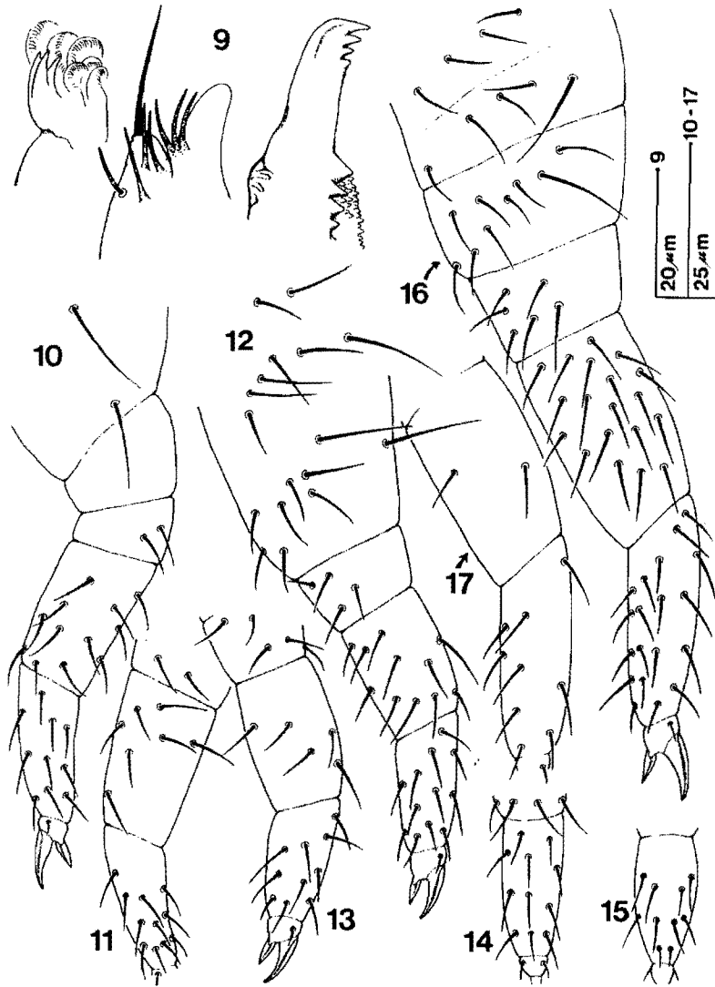
Figures 9-17. Cryptopygus bipunctatus . 9. Mouthparts (l.-r.): apex of maxilla; maxillary palpus and sublobal plate; apex of mandible. 10. Foreleg, exterior view. 11. Foreleg, interior view. 12. Mesoleg, exterior view. 13. Mesoleg, interior view. 14. Mesotibiotarsus, dorsal view. 15. Mesotibiotarsus, ventral view. 16. Metaleg, exterior view. 17. Metaleg, interior view.