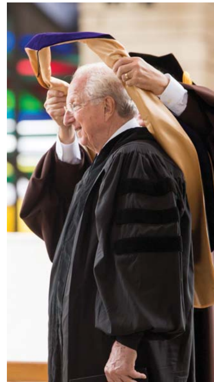
LORD HARRY WOOLF Lord Chief Justice of England and Wales, retired 2005

The Honorable Lord Harry Woolf was the recipient of an honorary degree at the 2015 Valparaiso University Law School commencement ceremony on May 16, 2015. Lord Woolf, a distinguished advocate, judge, and public intellectual, has been a dedicated friend and supporter of Valparaiso University. He has hosted students participating in Valparaiso University Law School's annual London and Cambridge summer program for many years, allowing students privileged access to the Royal Courts of Justice on the Strand, the Houses of Parliament, and the Supreme Court of the United Kingdom.