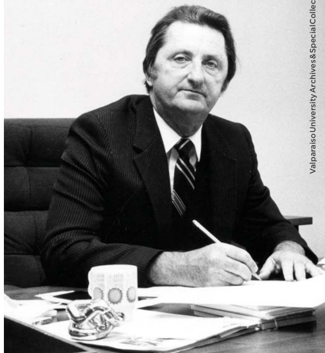
Valparaiso University Archives & Special Collections