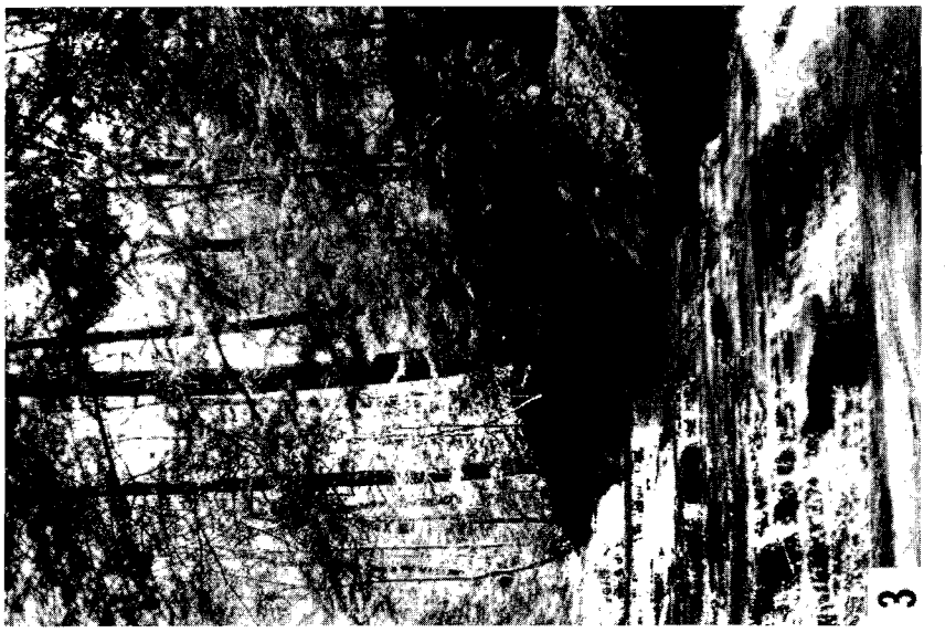
Fig. 3. Bedrock substratum of stream in gorge area.