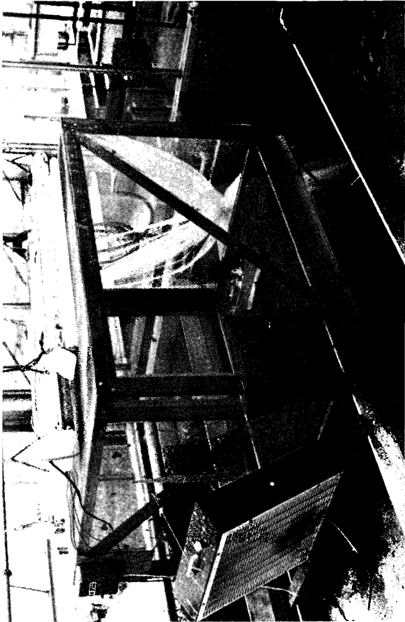
Fig. 2. Adult mating cage.