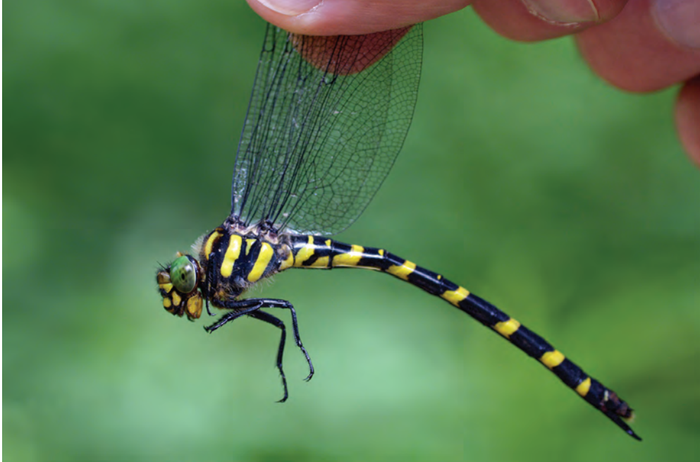
Figure 3. Cordulegaster erronea female from Fort Custer Training Center, 3 July 2016 (released after photo).

anomalous, given that it was far off the known range of the species. Prior to 2016, the nearest records to the Oceana County site were >350 km away (Abbott 2006-2017). Based on this single verified record, it is listed as a species of special concern in Michigan (MNFI 2007).