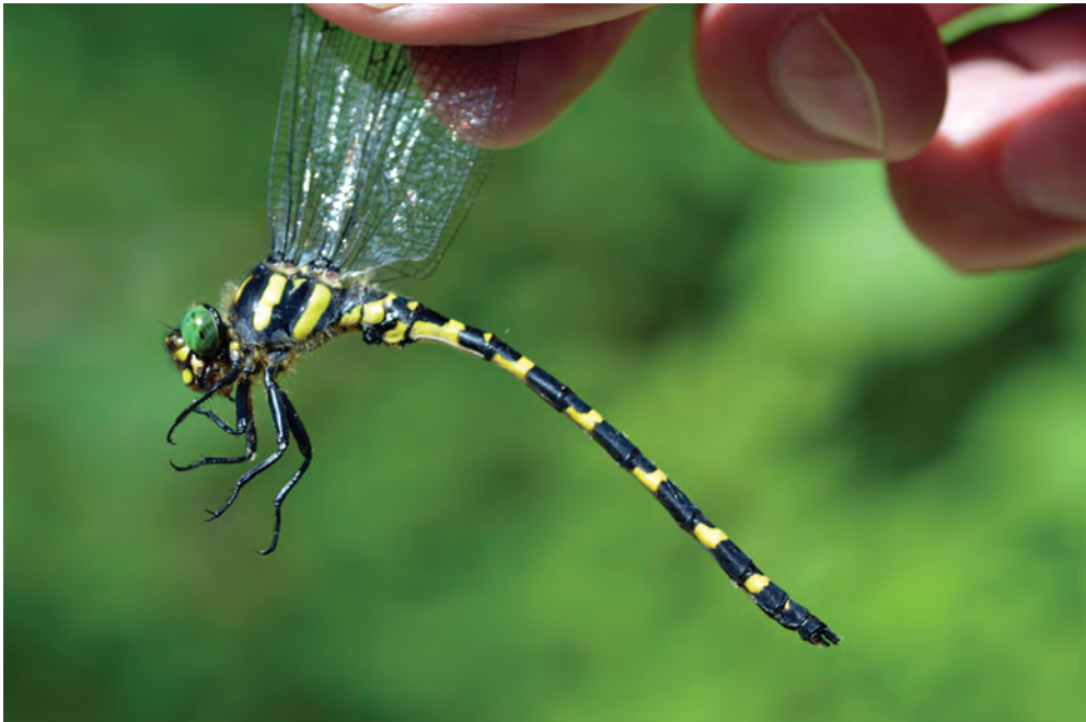
Figure 2. Cordulegaster erronea male from Fort Custer Training Center, 3 July 2016.

Silver Lake," Oceana County, in west-central Michigan, within 3 km of Lake Michigan (MOS001630). Given the source (Van Brink and Kiauta 1977), the veracity of the record was never in doubt but was thought to be