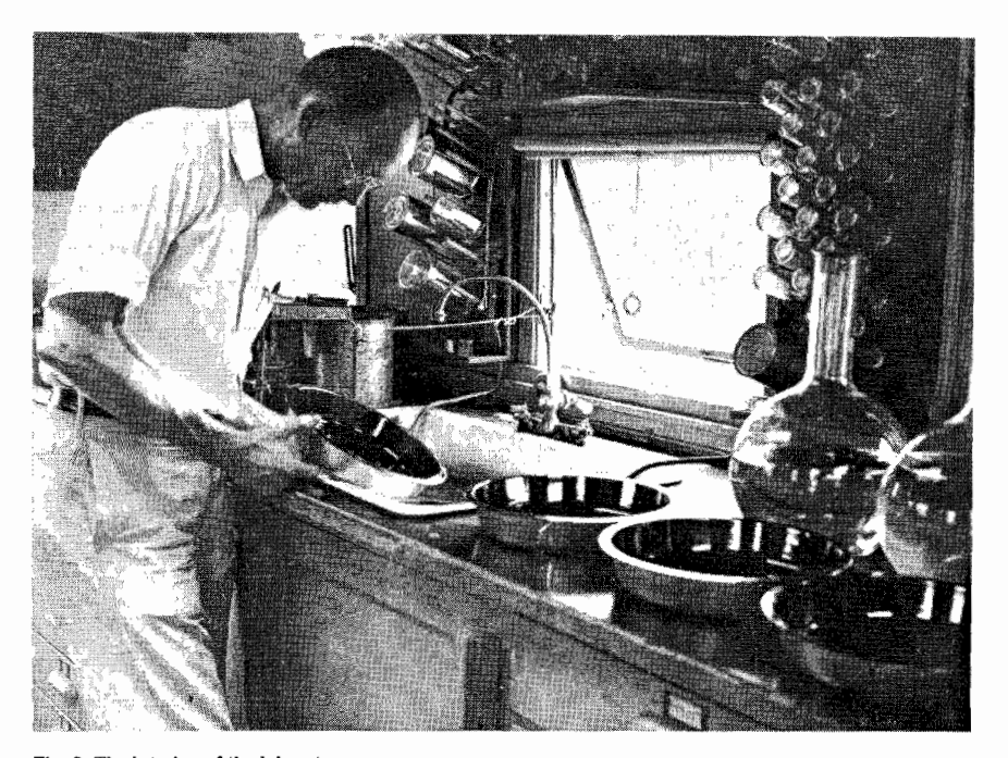
Fig. 2. The interior of the laboratory.