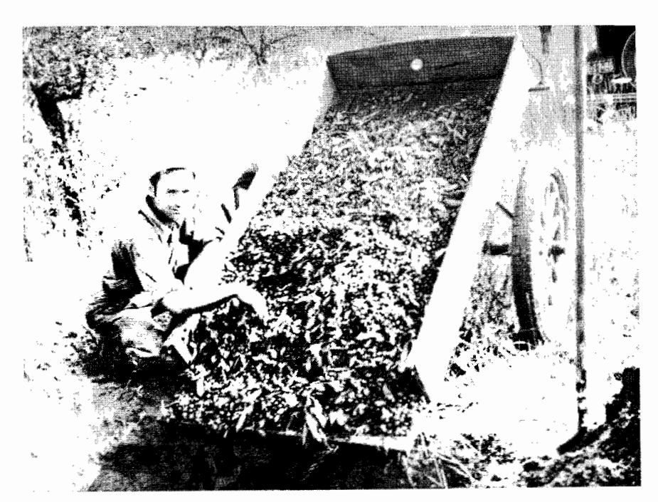
Fig. 4. Infested cherries being dumped into a pit.