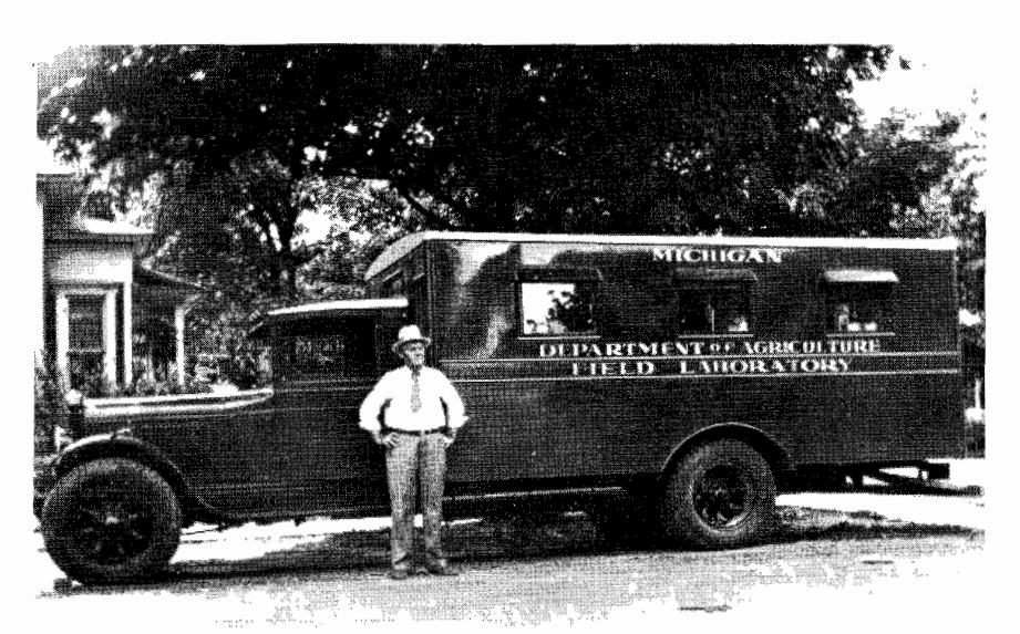
Fig. 1. Michigan Dept. of Agriculture field laboratory, 1931.