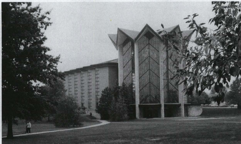
Chapel of the Resurrection