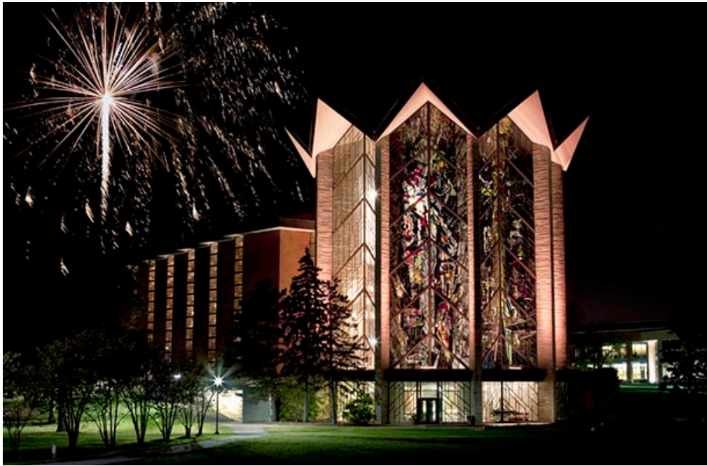
Chapel of the Resurrection