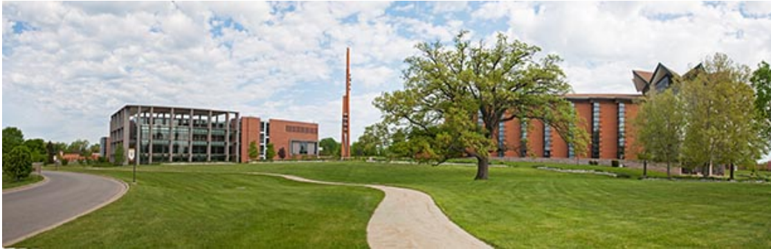
Christopher Center for Library & Information Resources and Chapel of the Resurrection