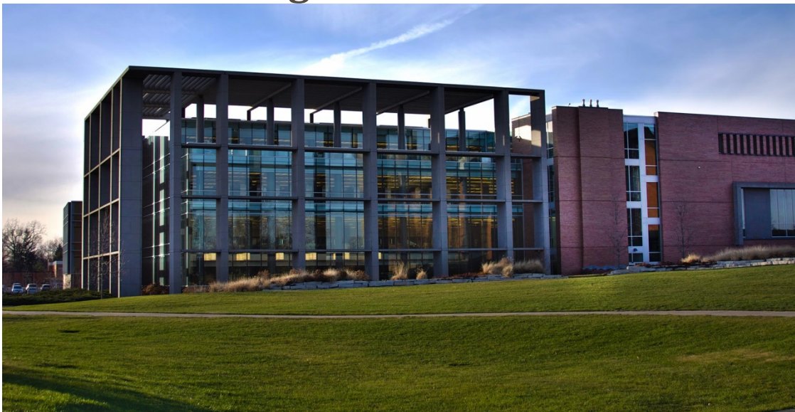
Christopher Center for Library and Information Resources