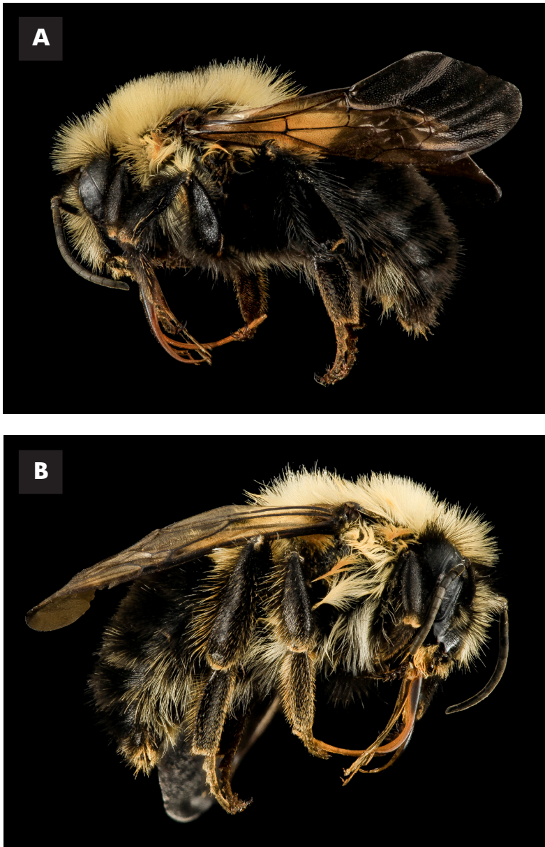
Figure 4. A distinct secondary sex characteristic in the Bombus genus is the presence of a corbicula in females. A) shows the female corbicula with a smooth hairless section in the center. B) reveals the opposite side of the gynander where a corbicula is distinctly lacking on the hindleg and is instead convex and covered with hairs.