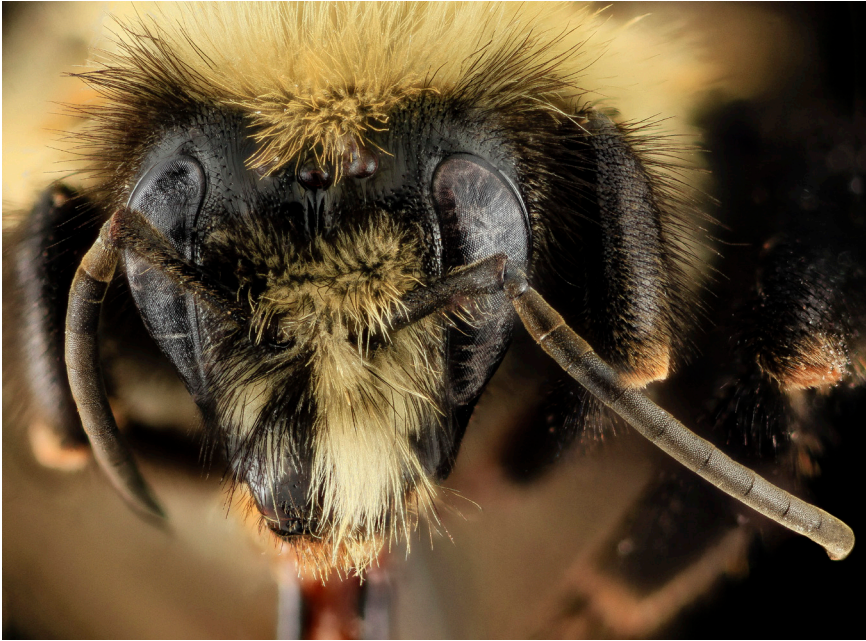
Figure 2. The gynander of B. bimaculatus exhibited differentiation in the number of antennal segments present, with 12 segments on the right (female) and 13 on the left (male). At the base of the antenna, black hairs predominate on the right (female) whereas on the left mainly yellow hairs are present (male). Left and right refer to the bee's left and right sides, not the photo.

the specimen. Since resecting the genitalia is not a common practice for normal bee identification, we did not perform this procedure upon initial pinning. The specimen has since become too brittle and frail to safely determine this.