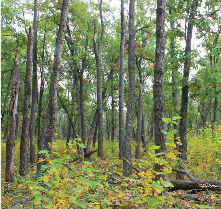
Figure 2. Aspen stand habitat where both male specimens of Acrocera bakeri were recovered from a Malaise trap (image taken 29 September 2014).