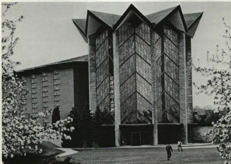
Chapel of the Resurrection

Drafts, checks and money orders should be made payable to the Valparaiso University Association, Inc.