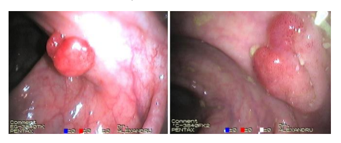
Fig. 1. Different endoscopic aspects of polyps located at the level of the left colon.

recording subsystem consisted of a thermal transfer color printer and external recording equipment for digital observation in ICU for about 2 hours where all vital images – a PC based station. All tissue samples obtained were processed in the pathologic anatomy laboratory of complications, such as bleeding or colonic perforation. our hospital or, whenever considered appropriate by our No special medication was used after the procedures and pathologist, samples were referred to a specialized laboratory for immune-histochemical processing, not yet available in our facility.