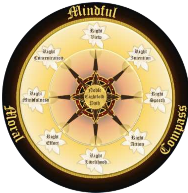
Figure 2: The Noble Eightfold Path as a Mindful Moral Compass for Leaders

While some may think that the ancient eightfold path is too idealistic for contemporary leadership practices, there are hopefully enough who may start utilizing this path as a mindful moral compass in their decision-making and directional processes. The fact that the elements of this path are interrelated makes its implementation easier than initially estimated. The leaders presented in this article are exemplary of that. While they have not been spared from setbacks and disappointments on their leadership journey, their overall accomplishments are widely praised, and their ideas and actions applauded.