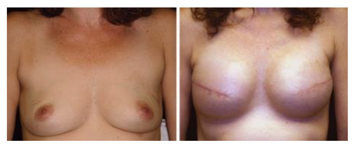
Fig. 4 - Immediate breast reconstruction using breast implants/expanders following a skin-sparing mastectomy

Given the more than reasonable results, especially when aiming to achieve breast symmetry in bilateral breast reconstructions, all this with less time spent in the operating room and without having to worry about any donor site comorbidities, breast reconstruction using alloplastic materials ( Fig. 4 ) benefits from a far greater popularity than its counterpart in both Europe and the US (11).