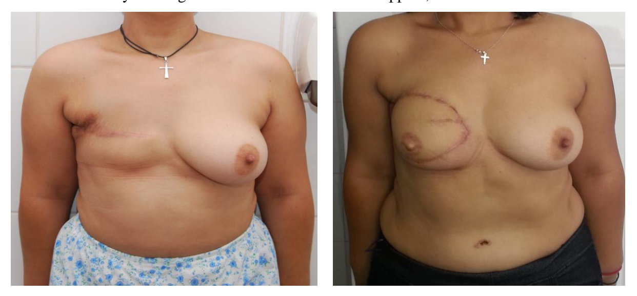
Fig. 6 – Right breast reconstruction using a pedicled TRAM flap

Presently considered the standard of care in autologous breast reconstruction, the transverse rectus abdominis muscle flap (TRAM) was introduced in 1982 by Hartrampf et al. Based on the superior epigastric vessels, the TRAM flap (Fig. 6) provides adequate soft tissue, harvested on muscular perforators arising from the underlying rectus abdominis muscle, for creating a suitable breast mound, whilst simultaneously making the lower abdominal fat disappear, feature that most women find very