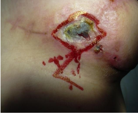
Fig. 1 – Radiation therapy complications Isle of skin necrosis managed by means of local skin flaps.

Although no single procedure outshines the others, careful patient selection plays a key role in obtaining the best possible relative outcome. When planning a breast reconstruction, after the oncologist formally rules out any form of residual cancer, one must take into consideration several critical factors that will eventually condition the technique election process (9). Radiotherapy, if employed, exerts a cruel effect on the post-mastectomy skin flaps,