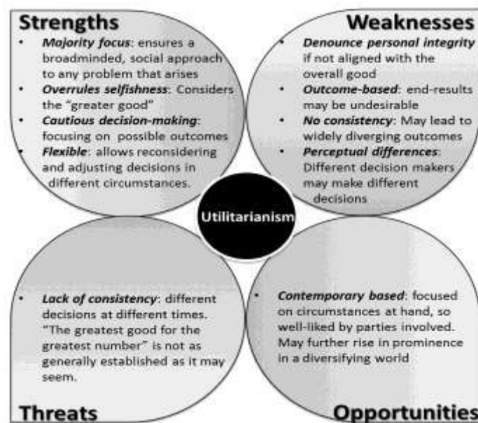
Figure 3 below presents the above-mentioned SWOT analysis for Utilitarianism in a nutshell.

The lack of consistency, not only seen over time, but also in the decision-making processes from various Utilitarians simultaneously, based on their viewpoints and the information they have at hand, may become an increasing source of concern – leading to outcomes that bring more harm than advantage to a community. “The greatest good for the greatest number” is not as generally established as it may seem, but is a very personal perspective.