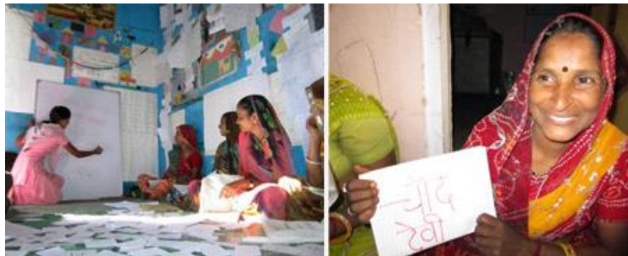
The Alternative Education Program run by JRC educates weavers in basic literacy. This program is setting the foundation for preparing weavers to take informed decisions not only about their lives but also about business.

cunningness or being crafty is something that we do not tolerate. Then lying, resorting to cheating, or even covering up for lack of dexterity in work — these are some things that we want to totally eliminate. Integrity and character are two important values