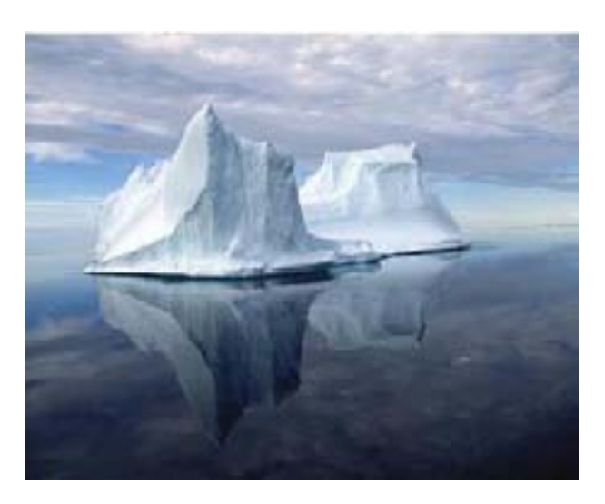
The Arctic

Sometimes. At that time, everybody was doing different things when he was traveling a lot. I had stopped working at the museum and I was doing contract work and so my schedule was much more flexible. So I tried to go with him as much as possible. And that was his idea — to study the ice flows, masses, and charts.