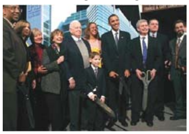
Cromer Children's Hospital

I was in high school when he started the Comer Foundation . It was in the mid-80s when he started it. We would all get together around the holidays and decide which cause was a good one to give to. We