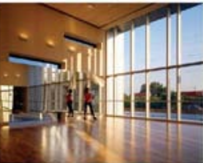
Gary Comer Youth Center

co-founded). Additionally, she is a member of the Chicago Climate Action Plan's Green Ribbon Committee, the Board of Trustees of the University of Chicago Medical Center, and the Gary Comer Youth Center.