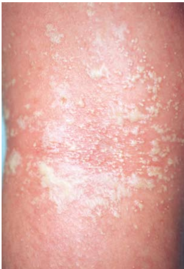
Figure 1. Close-up view of numerous superficial, non-follicular pustules arising on a widespread erythematous base.

spared. Results of laboratory evaluation revealed white blood cell count of 21 \times 10^9/L (NR 4.5-9 \times 10^9/L ), with neutrophil count 12.2 \times 10^9/L (NR 2-6 \times 10^9/L ) and erythrocyte sedimentation rate (ESR) of 28 mm/h. Liver function tests, urea, creatinine, electrolytes, and serum calcium level were within the normal limits. Viral serology, C-reactive protein, antistreptolysin O titers and bacteriologic studies of pustules were negative.