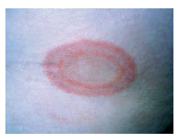
Figure 1 . Annular erythematous macular lesion on the left leg of our patient

diagnosed at the time of hospitalization at our department. We referred our patient for neoplastic screening, which found no data of neoplastic activity so far. The cutaneous lesions moderately improved after treatment with potent local steroids.