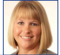
By Emily M. Janoski-Haehlen

P ortable Document Format (PDF) is the de facto standard for the secure and reliable distribution and exchange of electronic documents and forms and creating professional PDF documents has become easier than ever. There are web services, computer software applications, and printer subsystems that allow the user to create PDF documents from scanned paper documents and other file formats. Using PDF files solves many common file-sharing problems, from preserving the look-and-feel of the original document to allowing anyone, on any platform, to view, navigate, and print documents using the free Adobe Acrobat Reader.