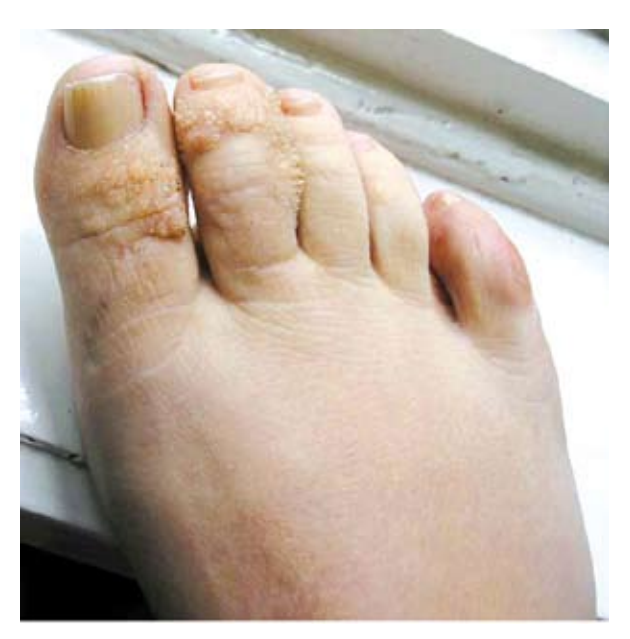
Figure 1 . Clusters of blisters in a herpetiform arrangement that partially had verrucous surface on the first and second toe of the patient's right foot.

epidermis and dilated vascular spaces in papillary dermis. Elongated dermal papillae were present (Fig. 2). The diagnosis of superficial lymphangioma was confirmed.