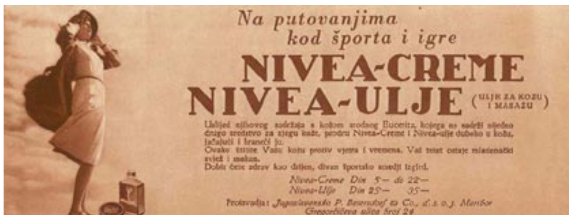
During travels, at sport and recreation, use Nivea cream and Nivea oil! From the Nivea collection of Zlatko Puntijar