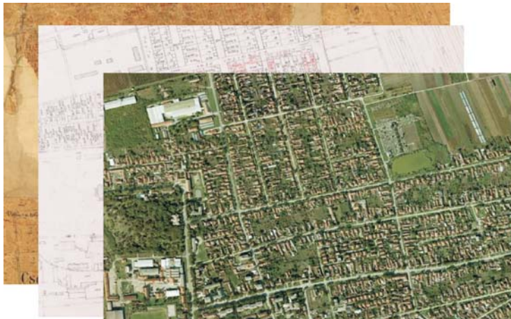
Fig. 5. Orthophoto, cadastral plans and copies working original of identical Datum.