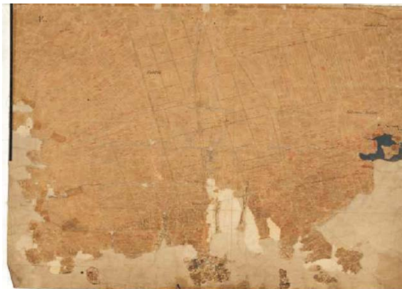
Fig. 1. The actual state of scanned cadastral plan, part of Čoka municipality.

Čoka municipality is placed in the northern part of the Republic of Serbia, in northern Banat. The plans for cadastral municipalities of Jazovo, Ostojićevo, Sanad, Crna Bara and Čoka are produced in scale of 1:2880 using graphic method in stereographic projection, based on the survey from 1876-1903 in Budapest coordinate system. Cadastral plans in stereographic projection, which cover about 70% of the municipal territory, are almost (90%) unusable for qualitative implementation of spatial changes in real estate or for activity and maintenance of real estate cadastre. Besides the plan sheets from that time period, which are in daily use, the land registers with parcel's areas are saved in hvat measurement system (analogous to fathom). It can be concluded that the lack of updated and digital cadastral records prevents any further development of information systems which would use geodetic data and prevents the effective usage of modern computer technologies in the process of real estate databases.