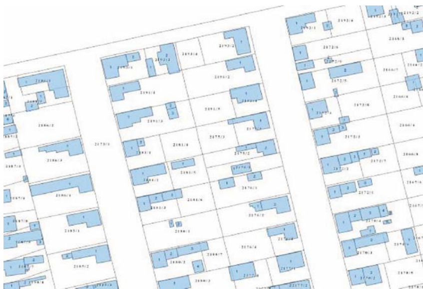
Fig. 7. New digital topographic plan with the numeration of objects within parcels.

The table below shows the differences in areas obtained from new updated digital plan and parcel areas from land cadastre. It is concluded that 90% of these differences are within the boundaries of permissible deviations.