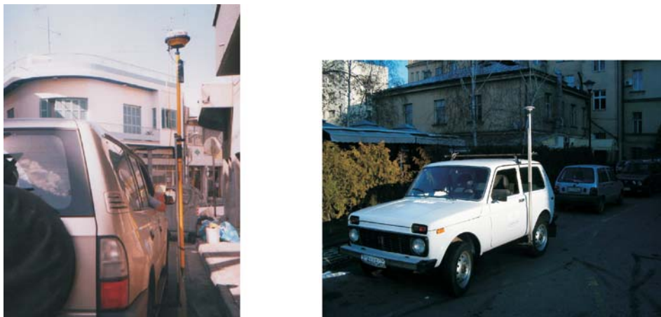
Fig. 3. Vehicles with fixed GPS.

mining the local Datum for the area of interest (territory of the project). The measurements of control profiles were carried out by the method of continuous kinematics using corrections from AGROS permanent station network from Republic Geodetic Authority RGA. Measured control profiles along horizontal signal lines (visible in orthophoto), had the spatial coordinates calculated in every ten meters, approximately. Measurements were carried out by using GPS device fixed to the vehicle, with fixed GPS height and the vehicle was moving in a way that the vertical axis of GPS was above the street centre line with an accuracy of 3-5 cm, vehicles are shown in Fig. 3 (Ninkov et al. 2010). The vehicle was moving at the speed up to 30 km/h, registering points every second, providing coordinates of points on centre line with a distance of less than 10 m. Achieved accuracy of locations in the horizontal signal lines, after numerical processing and setting the regression line, was within 3-5 cm provided by AGROS network of Republic Geodetic Authority and navigated driving along the lines of horizontal traffic signalization.