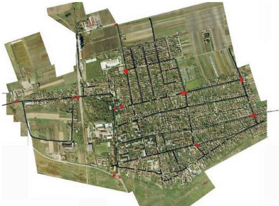
Fig. 4. Scale improvement of orthophoto using control points and profiles recorded by GPS (▲ – control points).

A large number of identified points (a church, a castle, different objects, some roads, crossroads) from the period of measurement in stereographic projection in scale of 1:2880, was transformed using ERDAS software based on a set of coordinates in both coordinate systems (Budapest and Gauss-Kruger) to scale of 1:2500 and Gauss-Kruger projection. In this way the stereographic plans were transformed into the same coordinate system and the same scale as orthophoto plans of the territory of the project (area of interest).