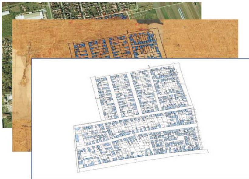
Fig. 6. Digitization of missing parcels and objects.