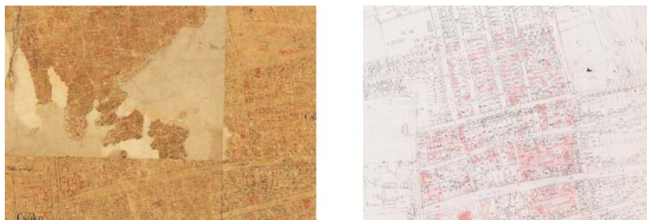
Fig. 2. Geocorrected map sheets and plans of maintaining the construction area of Čoka.

Plans in stereographic surveying have scale of 1:2880. Urban construction area of Čoka covers four map sheets numbered 14, 15, 22 and 23 in the sheets numeration for the whole cadastral municipality of Čoka. The plans are scanned in the Republic Geodetic Authority (RGA), Department of Geodetic Information System, according to the official procedure applicable in plan sheets of tiff extension. Scanned plans are geocorrected (georeferenced).