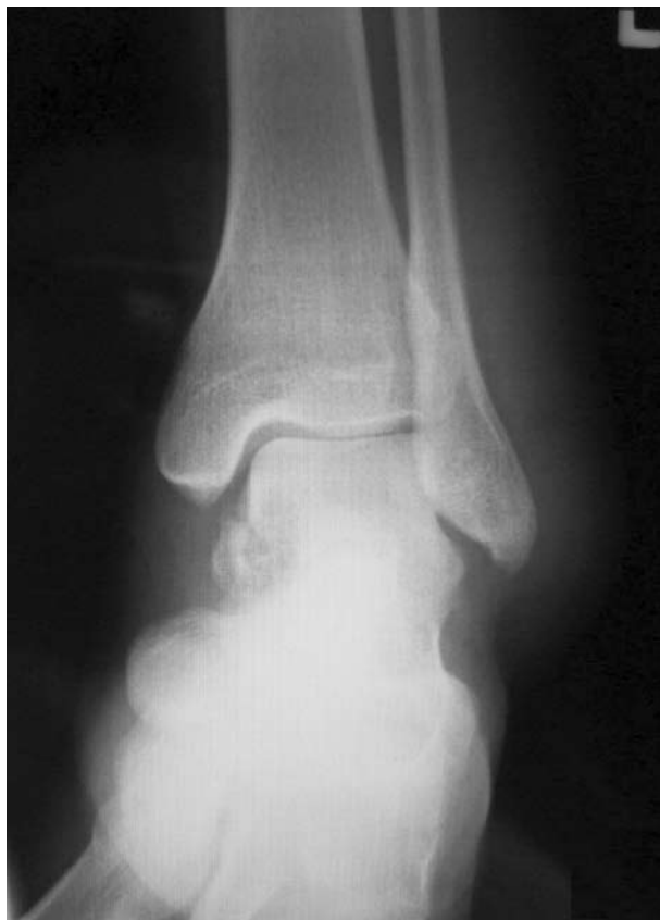
Fig. 1. Anteroposterior x-ray image showing ankle joint with inhomogeneous transparency in the area of medial talus.

On follow-up examination after three weeks, the patient's immobilization was removed and he started physical therapy. Even though the edema and hematoma slowly subsided during the next two months, the patient still complained of a sharp continuous pain in