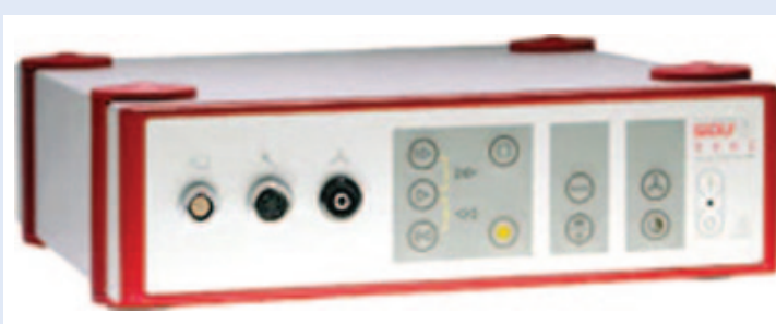
Figure 1. Outlook of the endocamera made by Richard Wolf GmbH (Knittlingen, Germany). Model used herein was labelled "Richard Wolf 5562 Endocam®".

in laryngology 3 . Since the first observation of the layered microstructure of the human vocal fold made by Hirano advanced diagnostic and surgical methods to raise voice quality. Stroboscopy has been initially developed as the most objective and practical method for clinical evaluation of phonatory mucosa 4 . Introduction of endocam into everyday clinical practice has improved diagnostic possibilities and, as well, provided laryngologists with various new treatment options 3 . Endocamera can be used to diagnose and treat a great number of disorders that have, until now, remained in the realm of a subjective estimation occasionally limited by the vision and expertise.