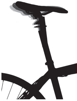
Figure 3. An adjustable saddle position, which enables the cyclists to adjust the angle and position of the saddle by putting it into three different positions: (1) horizontal position (normal), (2) 10% angle of the saddle and (3) 20% angle of the saddle. Note that the forward movement of the saddle and optimized saddle angle does not alter the saddle height.