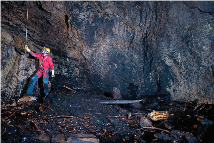
Fig. 8. Bottom of Golovranica pit, place of finding of Acheroniotes golovranicensis sp. nov.