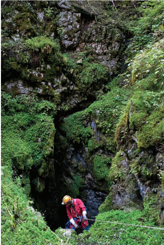
Fig. 7. Entrance of Golovranica pit.