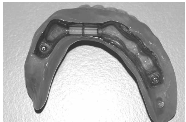
Fig. 4. Metal housing with retention parts.