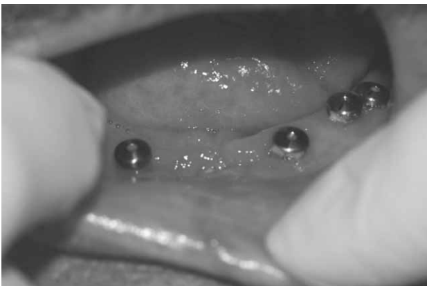
Fig. 2. Healing abutments after three weeks.