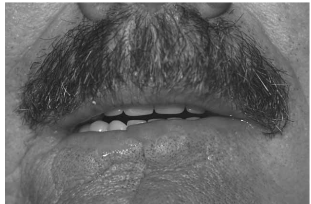
Fig. 6. Final prosthesis in mouth.

prosthetic rehabilitation the results were satisfactory, soft tissues were healthy with no signs of inflammation around the implants, and bone loss was absent.