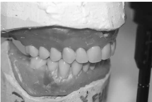
Fig. 3. Wax up in articulator.