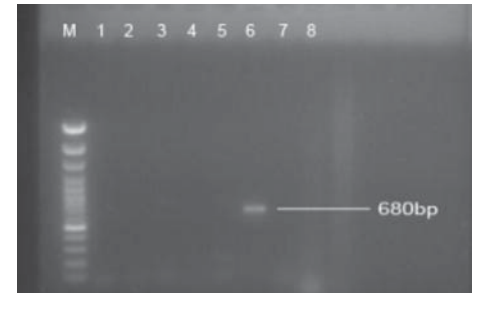
Fig. 2. RT- PCR test on samples for BVDV. Lane M: 100 bp DNA ladder, Lane 6: Positive control, Lanes 1-5 and 8: BDV positive specimens, Lane 7: Negative control.