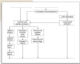
Figure 1. The pathophysiology of cerebral venous thrombosis (Piazza, 2012, p.1706).