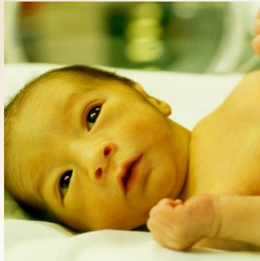
Figure 1. Infant with pathologic jaundice

ABO incompatibility can happen between a mother and baby primarily when the mother has blood type O and the developing fetus has blood type A, B, or AB. This happens because mothers with type O blood have anti-A and anti-B antibodies because the baby has A, B, or AB blood type. These antibodies cross the placenta and go into the fetal circulation. The antibodies then attach to the infant's red blood cells (RBC's) causing hemolysis of the RBC's. The attaching and attacking by the antibodies starts while the baby is still in utero. Hemolysis of RBC's cause an increase in bilirubin levels. In order for hemolysis to occur the antibodies have to attach to the RBC's (Rubarth, 2011).