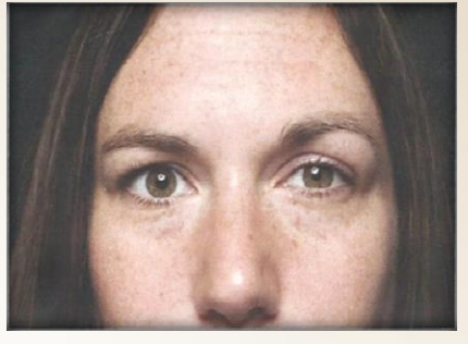
Figure 3: Left partial ptosis and miosis (Thomas, Price, Pollentine, 2012).

• Early detection of Horner syndrome can reduce risk of disabling stroke (Thomas, Price, Pollentine, 2012).