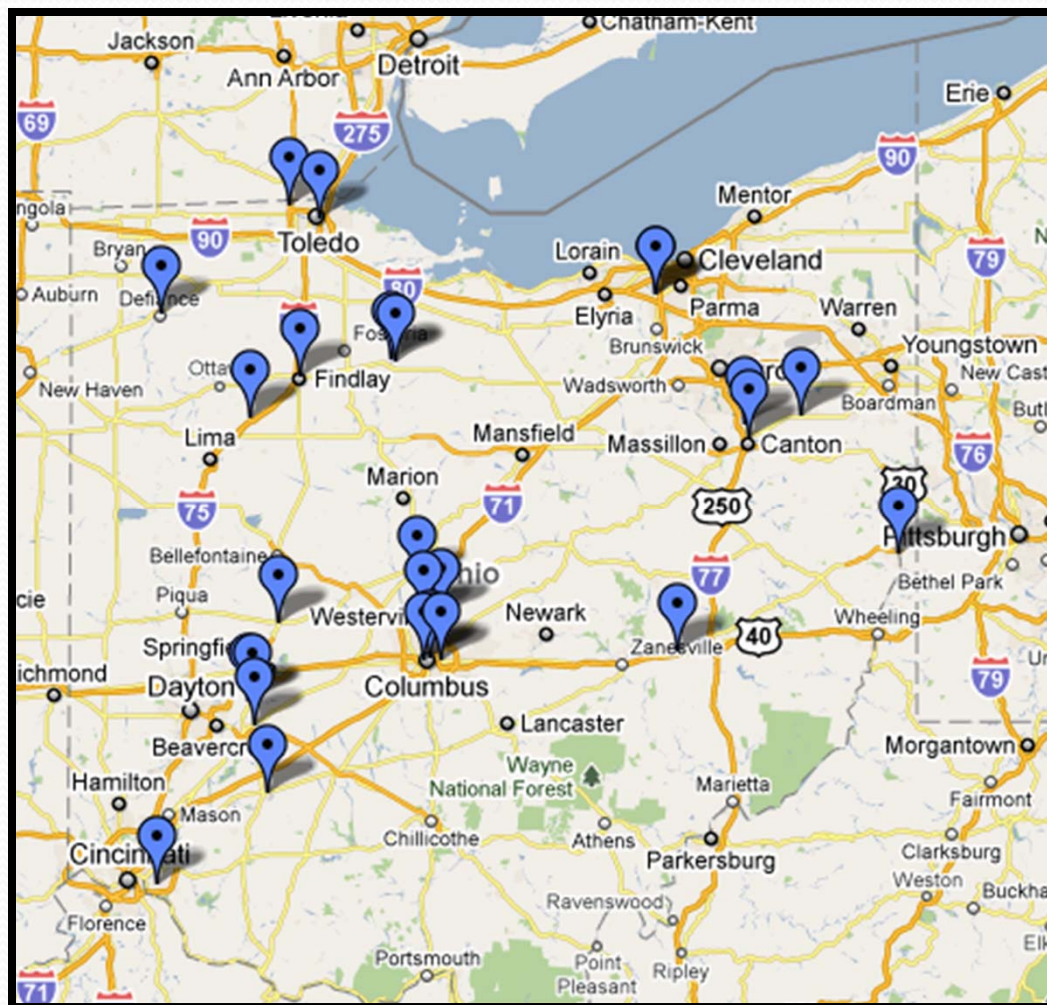
Locations of OPAL Libraries