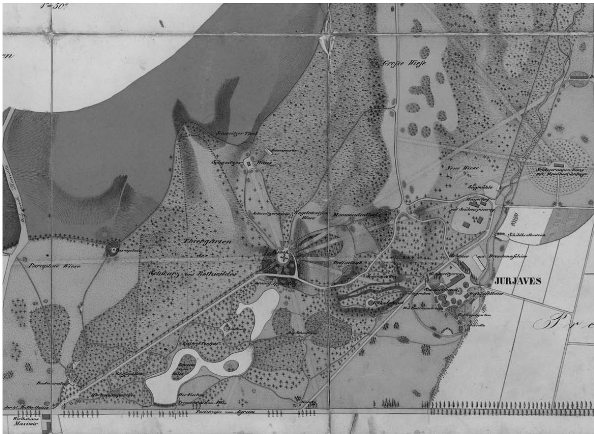
Figure 1 Plan of Maksimir Park from 1846 on which can still be seen traces of the original French concept of the park

arranged in Munich and when architect Izidor Canavale was making a plan for organising an English style park in Laxenburg (in 1783). This chronological coincidence is no coincidence. Many of that time's Croatian builders, engineers and other leaders went to school in Munich and Vienna and, after their return to their homeland they implemented their knowledge and experience acquired in Central European cultural circles.