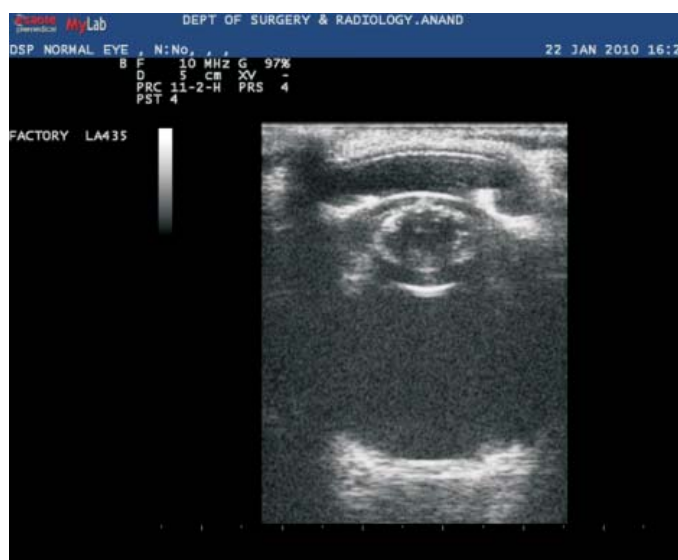
Fig. 2. Ultrasonogram of contralateral (right) eye showing cataract

cataract. In the posterior segment retinal detachment was evident, where the detached retina appeared as a smooth, complete, hyperechoic membrane in the vitreous (Fig. 1). In the sagittal plane, the detached retina looked like an isosceles triangle open towards the anterior segment. On real time ultrasonography a hyperechoic structure was found to be moving within the vitreous. All observations in the contralateral eye were found to be normal except for cataract (Fig. 2).