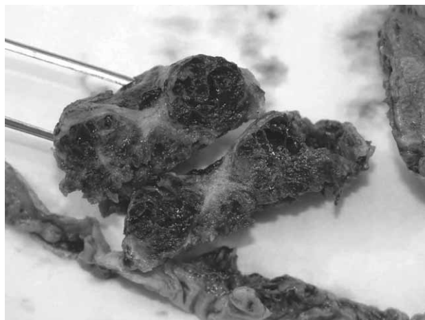
Fig. 2. Surgically removed specimen; the brown multilobulated, softly tumour tissue mass.

A total body radioiodine (I-131) scan didn't detect activity. A follow-up cranial CT scan showed no tumour recurrence. Ten months later patient's general condition remained well.