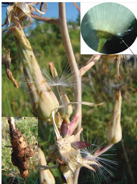
Fig. 2. Steptorhamphus tuberosus , a) inflorescens, b) root, and c) pappus