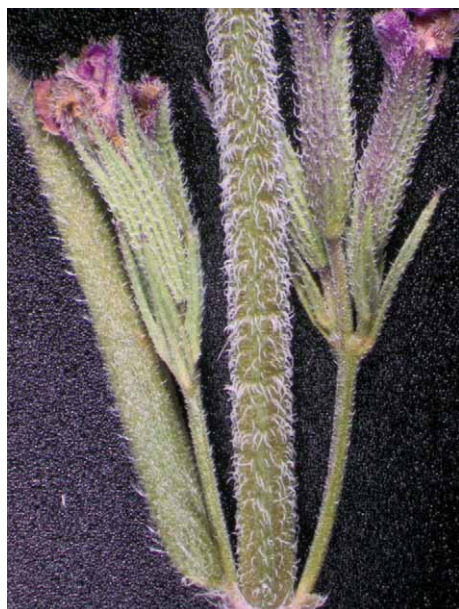
Fig 1. Micromeria cristata , verticillasters

The first records of Steptorhamphus tuberosus (Fig. 2) date from 2007. The species was collected in the vicinity of the village of Godinje (northern slopes of Rumija mountain, N 42° 13' 52", E 19° 06' 32", altitude 86 m), in the plant community Carpinetum orientalis punicosum O. Greb 1949., one of the degradation stages of white hornbeam forests and