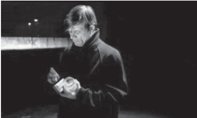
Photo 1. Aesthetization. Public advertisements. Verbal emotional appeal and visualization of cold weather outside, and of death

The character in the movie appears against the background of a bridge and a river. He says: “The last winter 250 people froze to death. (He lights the candle.) www.bezdomni.pl is the only address I have. (Darkness, candles in the background under the pillar of the bridge.) Help homeless people” (the text transcription and the snapshot from the public advertisement video http://www.bezdomni.pl/movies/bezdomni15.mpg ).