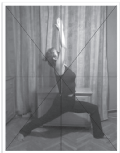
Photo 1. The slice of visual product and its content. Private visualization of yoga practice. Hatha yoga practice at home (photo from our research project)

Let us examine a case in point. Below is a transcription of an image and an open coding case (Table 1). The data come from our research project on “the visualization of hatha yoga practice”. The transcriptions and memos have been made by the researcher who has had inner knowledge of the social world. He has practiced yoga and studied thoroughly the principles of hatha yoga. The visualization of yoga practice is taking place in many contexts. The process of visualization of yoga practice has many dimensions. The most outer dimension is connected with presenting body movements according to strict rules. Yoga masters established these rules and there is an internal imperative to implement them in practice. The rules are about coordination of many movements, so the complexity of the correct yoga pose performance is very high. Another dimension is connected to experiencing bodies and minds during the actual exercise. Communicating it to outsiders is very difficult. Practitioners usually simply show the poses to interested audiences, instead of verbal explanation of the lived experience (see Photo 1).