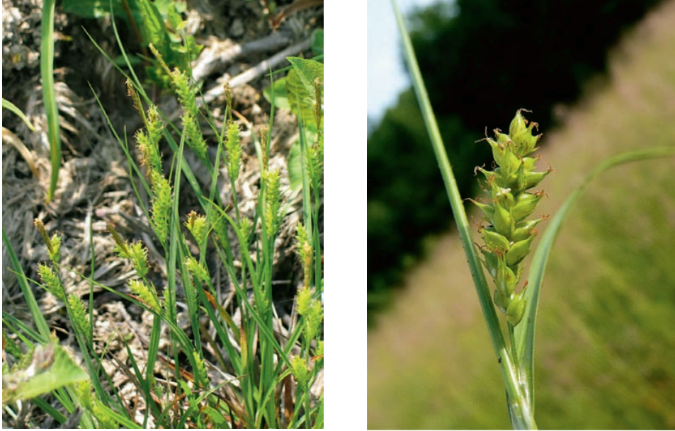
Fig. 1. Carex punctata Gaudin, from Pisarovinska Bregana (a), from NP Risnjak (b).

Terminal spike male, lower 3-4 female, oblong to cylindrical; all spikes erect (Fig. 1). Male spike less than 5 mm wide. Lowest bract sheathing exceeding the inflorescence. Utricles glabrous, not hairy, patent, shining, with 2-fid, smooth beak; 3 stigmas.