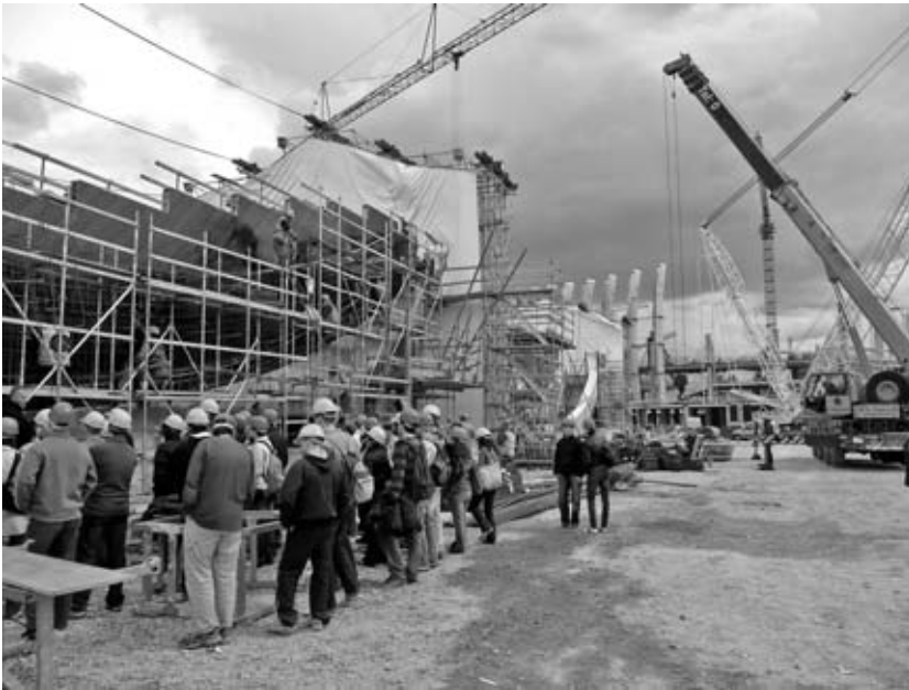
Figure 4. Students observed processes and “snap-shots” of Zagreb’s arena”

market position and to reduce risk in planning their projects. Simulation techniques are complementary to this process as they enable an preliminary evaluation of multiple design options for construction operations in the bidding phase of a project, and better control of ongoing construction processes during the execution phase.