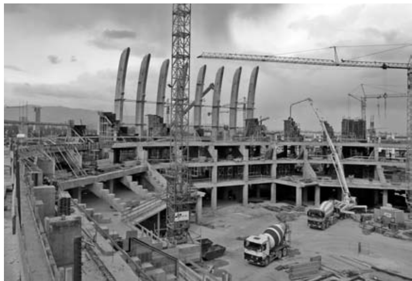
Figure 2. The real "site" of Zagreb Arena

According to the current authors' experience, local companies need to integrate both approaches to better plan and execute their construction operations. Creating comprehensive internal normative databases would help companies set internal standards for their products and services. Although many larger companies have, through time, elaborated their normative databases, small and medium sized companies still need to create them, to further stabilize their