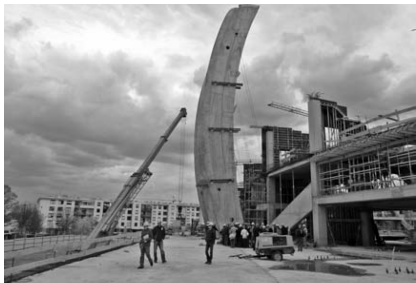
Figure 2. The construction part of Zagreb Arena