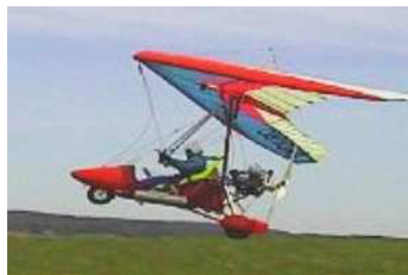
Figure 2: IMK-IFU's instrumented ultra-light aircraft.

The project will apply detailed numerical modelling on one hand and measurement campaigns on the other hand. The finest nests of the models and the campaigns will focus on the sub-target areas. Integrated measurements of meteorology, air pollution and noise as well as interviews in the population to assess the nuisance will be carried out at least in one campaign. Next to more traditional instruments such as fixed and mobile stations for meteorology and air chemistry, IMK-IFU plans to operate its instrumented ultra-light aircraft and a sodar (see Fig. 2).