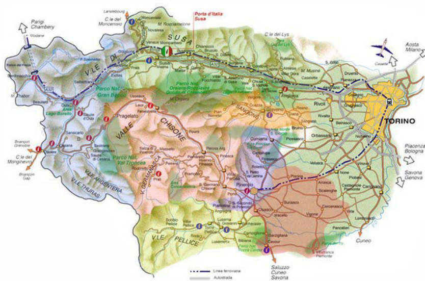
Figure1. Topographic chart of the Olympic Area highlighting the main roads

Since 2003 the Meteorological Department of ARPA Piemonte has been provided with a set of products for the monitoring and the forecast of ice formation over the main roads of the Olympic Valleys and over the stretches of regional motorways that join Turin to Milan and Turin to Piacenza, in the framework of Weather Support to Torino 2006 Olympic Winter Games. Fig. 1 shows a chart with the main roads of the Olympic Valleys.