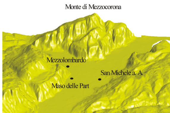
Figure 1. Topographic map showing the location of the experimental site Maso delle Part.

Close to the cut-blocks, in a grass field, a Scintec MFAS-64 Sodar was installed in order to measure the vertical three-dimensional wind profile from the ground up to 500 m, with a spatial resolution of 10 m and a time averaging of 30 minutes.