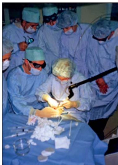
Figure 8 – Laser Eye Surgery at Ljubljana Eye Clinic in 2005.

Slika 8. Zahvat laserom na Očnej klinici u Ljubljani 2005.