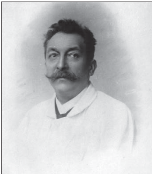
Figure 2 – Dr. Emil Bock (1875–1916) was founder of the first Eye department among Slovenians and led it from 1890 until 1916.

Slika 2. Dr. Emil Bock (1875.–1916.), utemeljitelj i prvi predstojnik očnog odjela u Ljubljani (1890.–1916.)