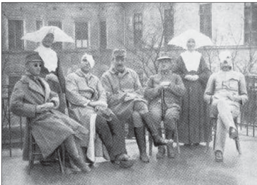
Figure 4 – Patients from the Eye department with nurses at Ljubljana civil Hospital Garden in 1915. (Photo Collection of the Ljubljana Eye Clinic)

Slika 4. Bolesnici očnog odjela sa sestrama milosrdnicama u vrtu ljubljanske Civilne bolnice (iz zbirke Očesne klinike u Ljubljani)