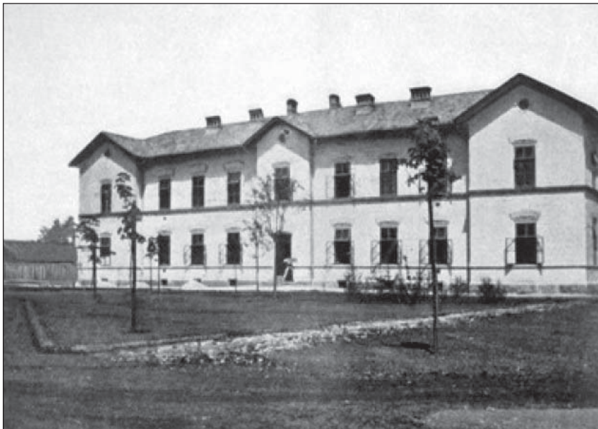
Figure 3 – The Building of the first Eye department among Slovenians at Ljubljana civil Hospital in 1895. Initially it had 34 hospital beds and until 1916 it was expanded to 120 beds.

Slika 3. Očni odjel bolnice na Zaloškoj cesti 2 (1890.–2012.)