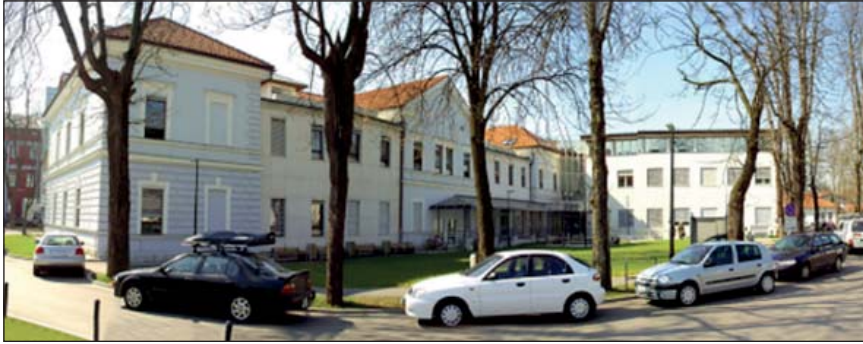
Figure 7 – New location of the Eye Clinic from 2001 at Zaloška str. 28 in Ljubljana. (Photo Collection of the Ljubljana Eye Clinic)

Slika 7. Nova lokacija Očne klinike, otvorena 2001. na Zaloškoj cesti 28 u Ljubljani (iz zbirke Očne klinike u Ljubljani)