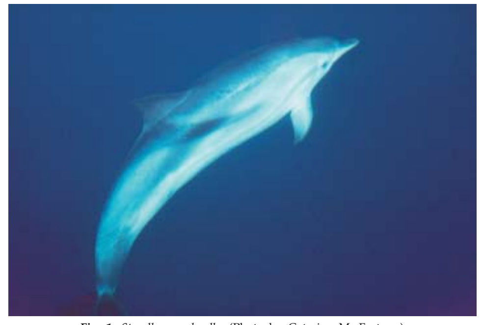
Fig. 1. Stenella coeruleoalba