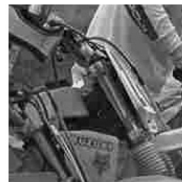
\tau = 0.42 bpp MOS = 2.8 Color distortion