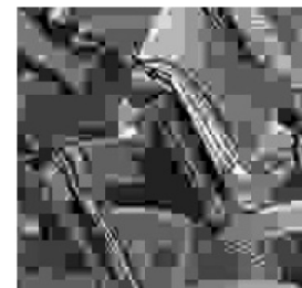
\tau = 0.21 bpp MOS = 2.3 Blocking effect