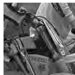
\tau = 0.13 bpp MOS = 2.2 Ringing effect